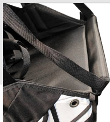
// front extension