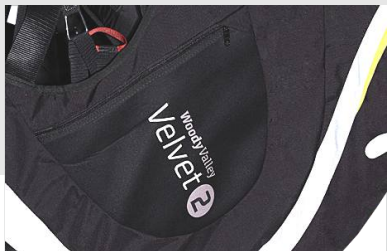
// two side pockets