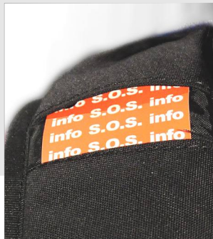
// Security Card