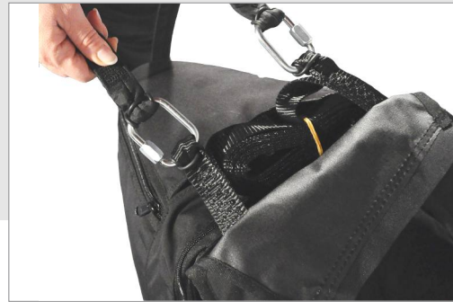
// double reserve parachute attachment