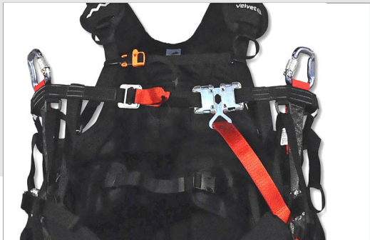
// T-LOCK system